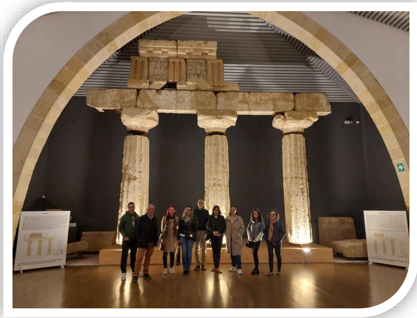
The representative from the QUEST partners posing at Baglio Florio Museum in Selinunte during the fifth project meeting.

Based on the increase of HE students' employability in the tourism sector, one of the fastest pacing sectors in terms of innovation and most afflicted by Covid-19 emergency, it investigates an innovative and skill-based programme for HE students that face the tourism sector labour market and policy and cooperation methodology.